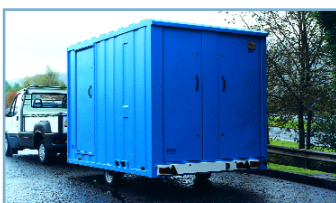
Tow to Site